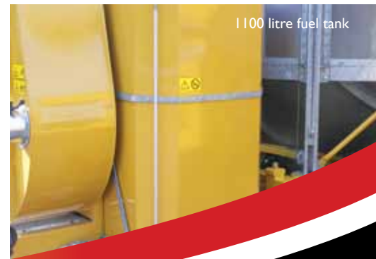
1100 litre fuel tank