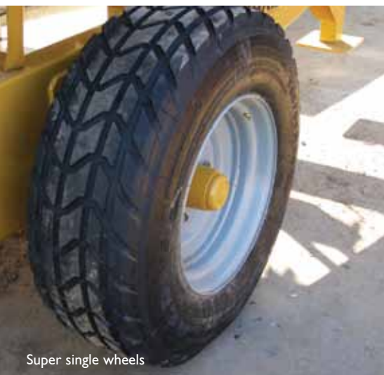
Super single wheels