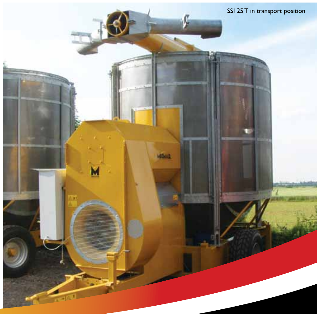
SSI 25 T in transport position