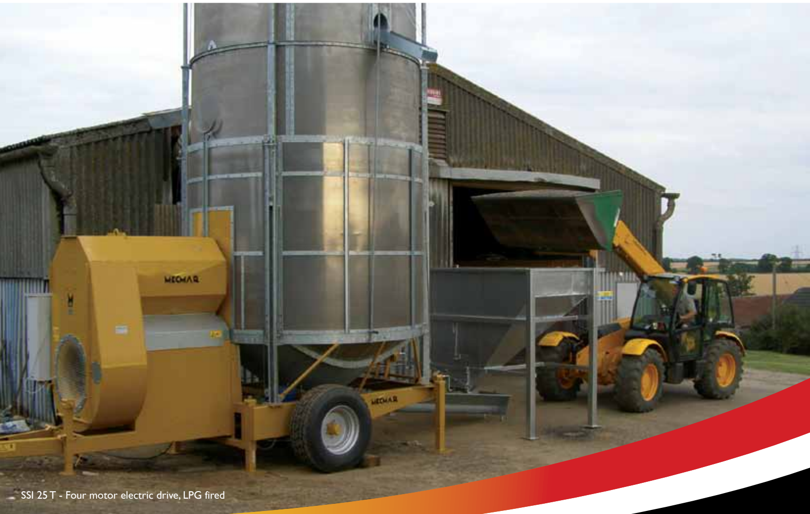
SSI 25 T - Four motor electric drive, LPG fired