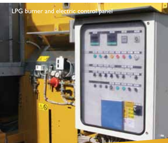
LPG burner and electric control panel