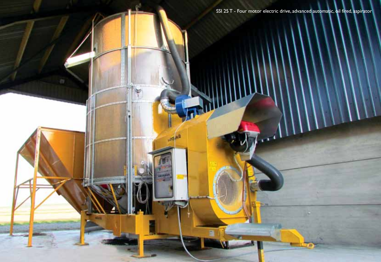
SSI 25 T - Four motor electric drive, advanced automatic, oil fired, aspirator