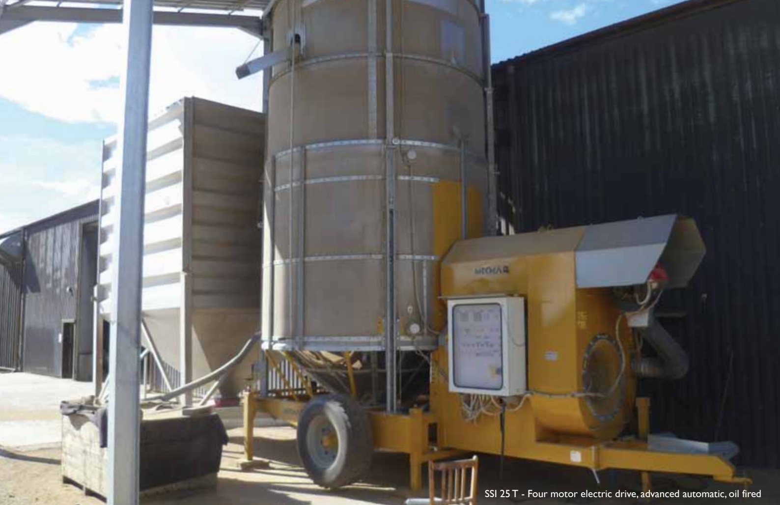
SSI 25 T - Four motor electric drive, advanced automatic, oil fired