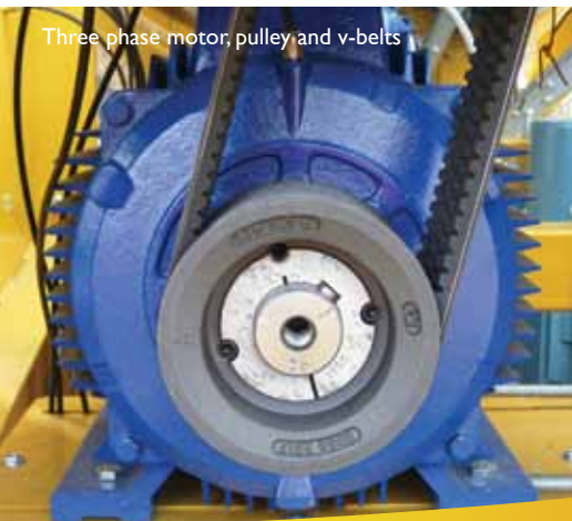
Three phase motor, pulley and v-belts