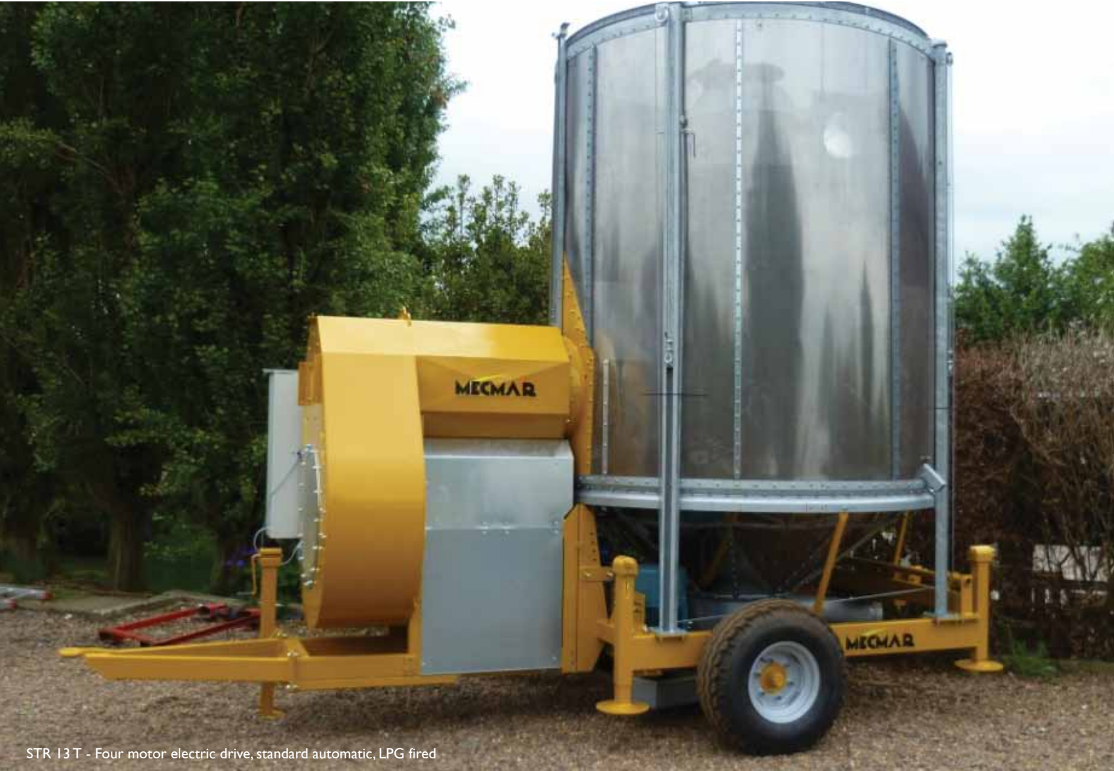
STR 13 T - Four motor electric drive, standard automatic, LPG fired