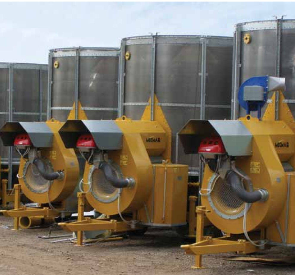
Mecmar grain driers prepared for delivery