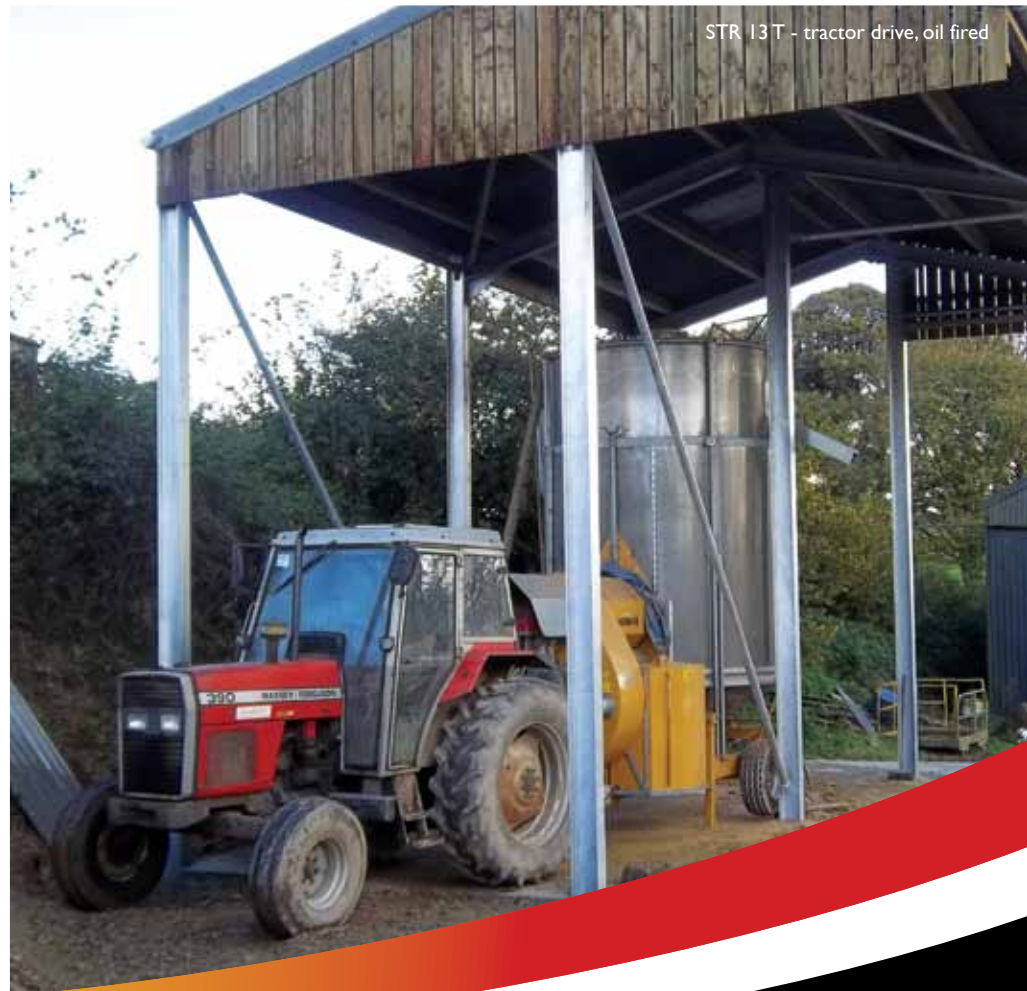
STR 13 T - tractor drive, oil fired