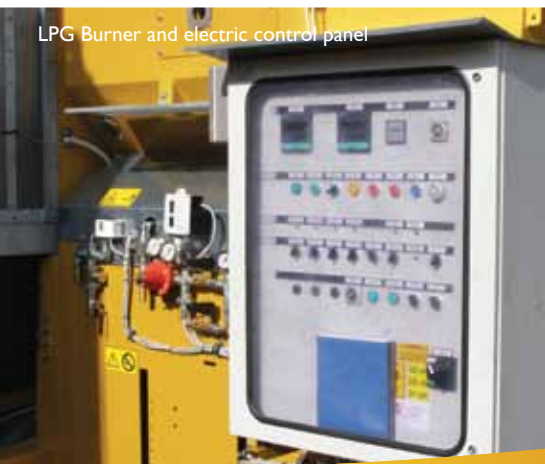
LPG Burner and electric control panel