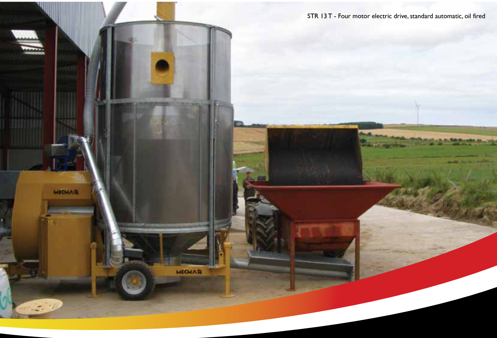
STR 13 T - Four motor electric drive, standard automatic, oil fired