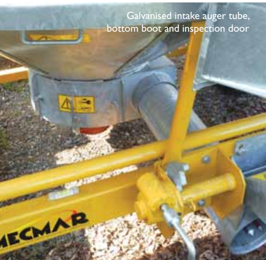
Galvanised intake auger tube, bottom boot and inspection door