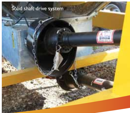
Solid shaft drive system