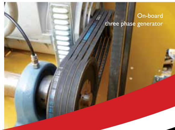
On-board three phase generator