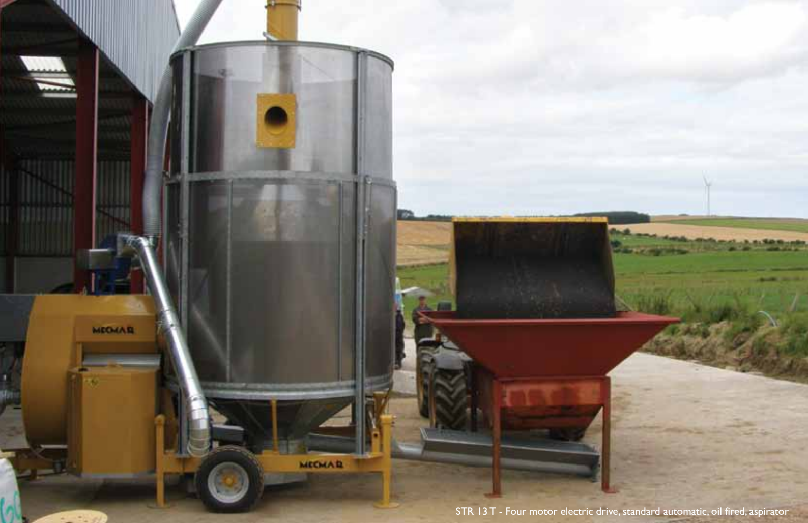
STR 13 T - Four motor electric drive, standard automatic, oil fired, aspirator