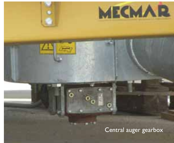
Central auger gearbox